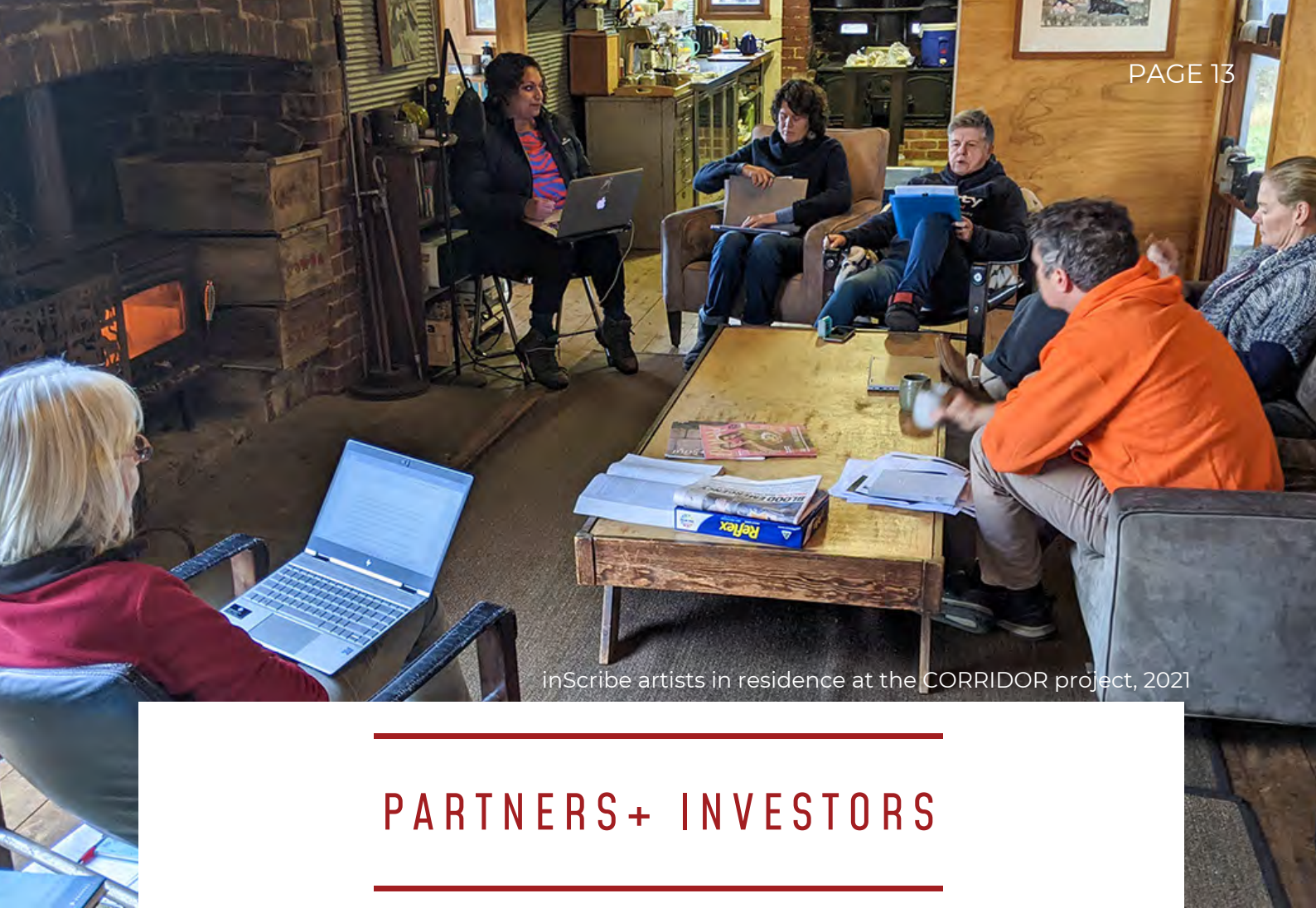
inScribe artists in residence at the CORRIDOR project, 2021